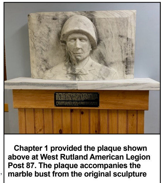
Chapter 1 provided the plaque shown above at West Rutland American Legion Post 87. The plaque accompanies the marble bust from the original sculpture